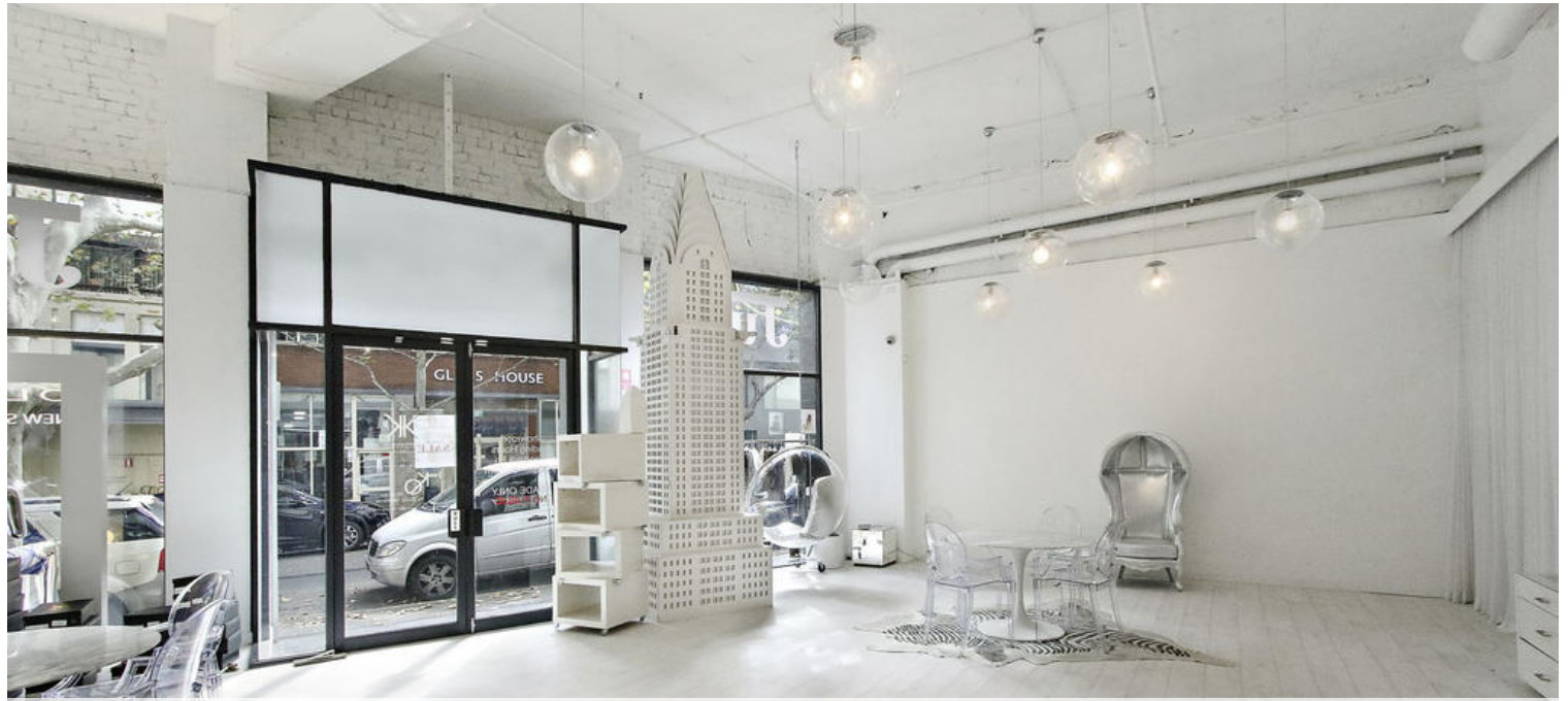
17 Cooper Street, Surry Hills