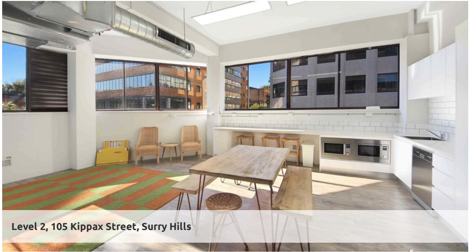
Level 2, 105 Kippax Street, Surry Hills